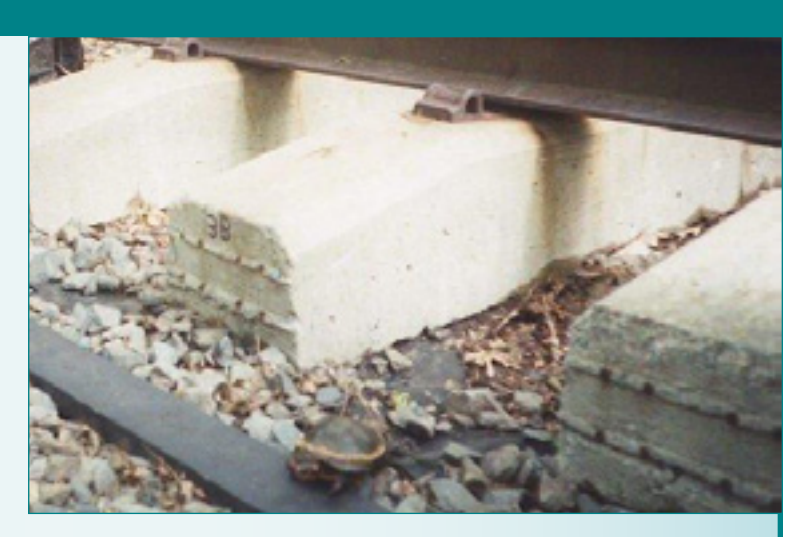
A turtle uses a critter tunnel to pass beneath the Greenbush Line tracks. South Coast Rail includes similar crossings to encourage wildlife passage.

Following the public review of the DEIS/DEIR, the Corps eliminated the Attleboro Alternatives and reevaluated the Rapid Bus Alternative, examining ways to improve ridership and eliminate bottlenecks. Many modifications were developed and evaluated. (They are described in Appendix 3.1-E, Modified Rapid Bus Technical Memorandum.) Despite these efforts, the Rapid Bus Alternative continued to show lower ridership, much higher cost and greater environmental impacts than the commuter rail alternatives. The Federal Highway Administration (FHWA) concurred that the Rapid Bus Alternative would degrade service on the interstate highway system and thus was not viable. The Corps, therefore, did not evaluate the Rapid Bus Alternative in the FEIS/FEIR.